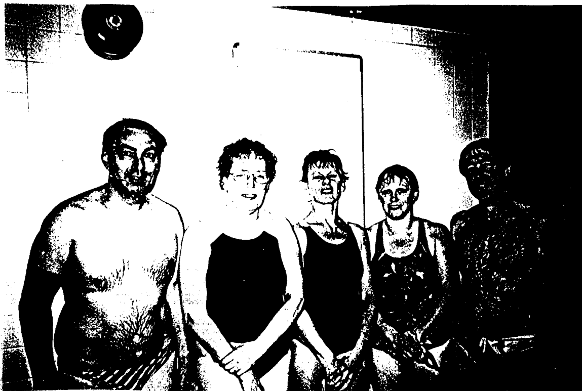
PHOTO OF SWIMMERS - OTTERS MASTERS GALA

Perhaps next year more of our Masters will be encouraged by these results and will enter.